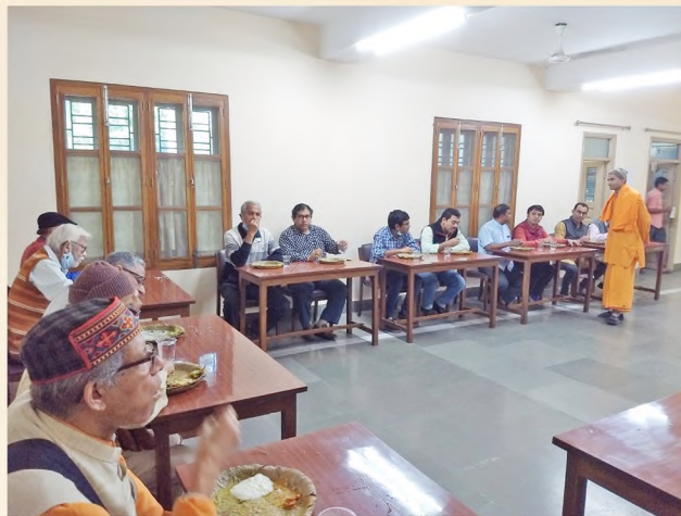
Alumni partaking prasadam at Nivedita Bhavan during Annual General Meeting 19th February 2022

Annual General Meeting of Mahavidyalaya Praktani was held on 19th February 2022 at 2:30 pm in the Conference Hall of the college. There was a participation of 36 members in person.