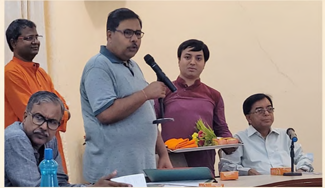
Secretary, MVP addressing in the Batch Coordinators meet

The first Meeting of the Batch Coordinators of Mahavidyalaya Praktani was organized on 26th March, 2023, which was attended by 47 members from different batches. All members shared their expectations and difficulties with each other and chalked out a road map for future action.