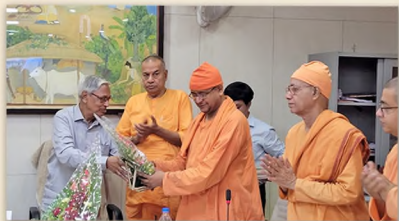
PASSING THE TORCH : EMBRACING CHANGE IN LEADERSHIP